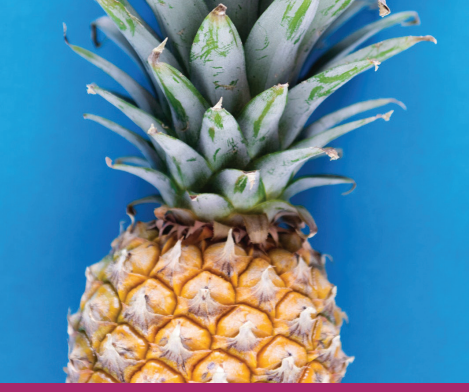
Frozen and canned pineapple are healthy choices, too.